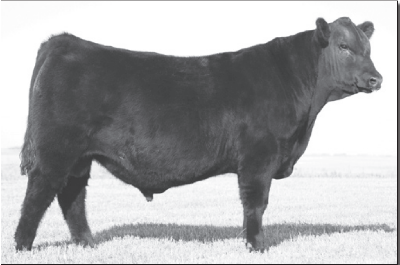
Mohnen Bingo 149 - Lot 55