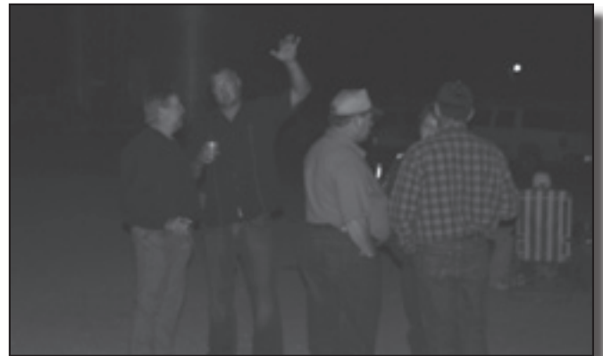
Customers enjoying visiting during the appreciation supper.