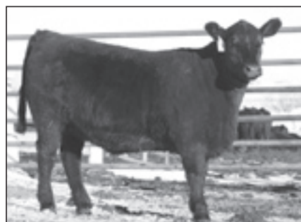
Mohnen Erica 79 - Lot 95