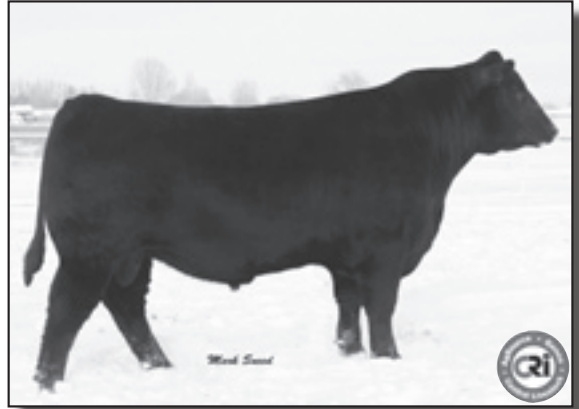
TC Aberdeen 759 - Sire of Lots 33-50.