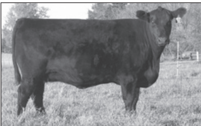
KF Gammer 243 - Dam of Lots 21-23.