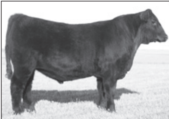
Mohnen Aberdeen 429 - Lot 34