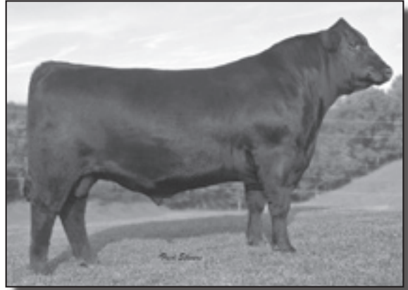
SAV Mandan 5664 - Sire of Lots 67-69.