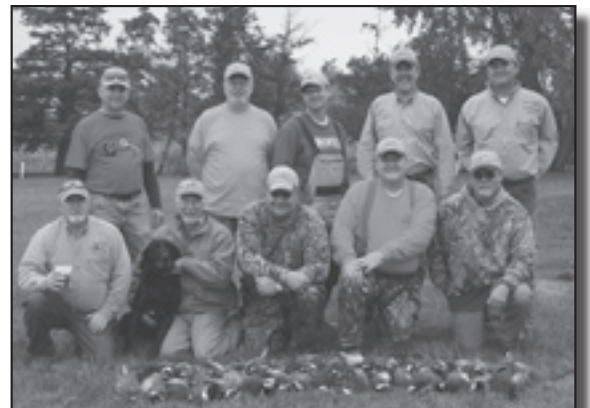
One of many successful hunts in 2009! Hunts available!