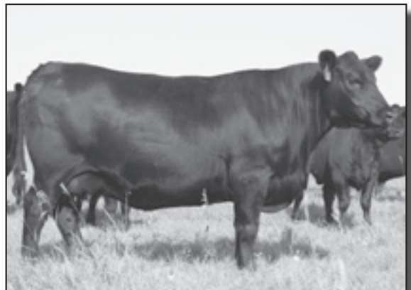
Mohnen Erianna 2576 - Dam of Lot 35.