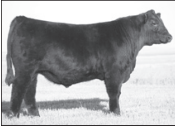
Mohnen Aberdeen 719 - Lot 37