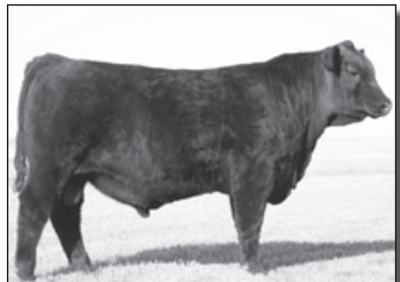
Mohnen Dynamite 289 - Lot 3