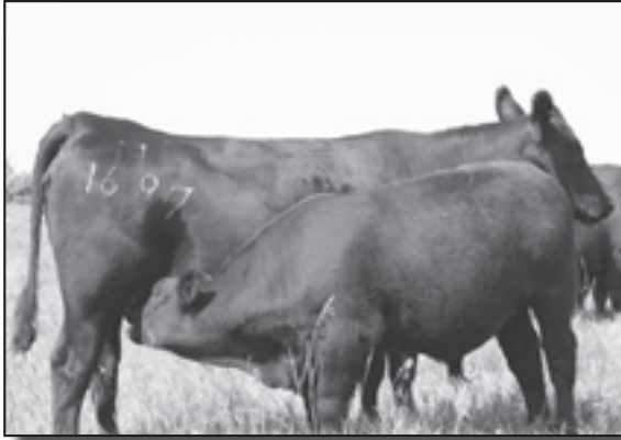
Mohnen Jilt 1687 - Dam of Lot 42.