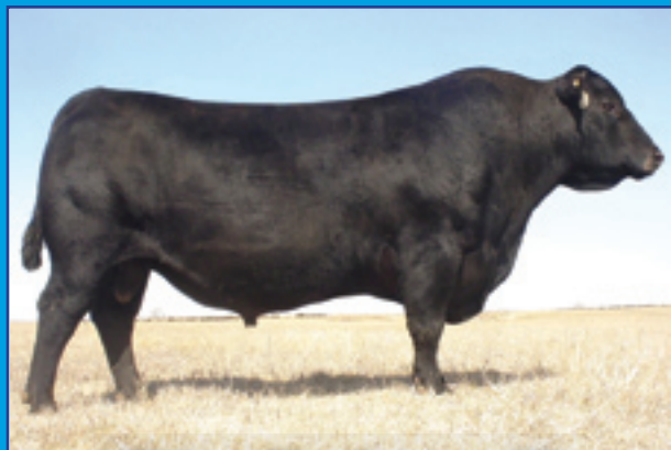
Mohnen Brushpopper 353