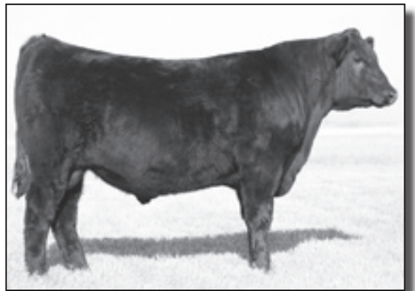
Mohnen Aberdeen 809 - Lot 41