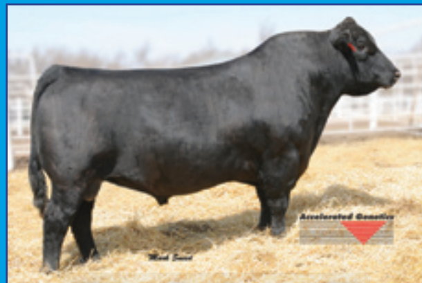
Mohnen Brushpopper 295