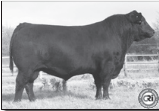
Mohnen Dynamite 1356 - Sire of Lots 1-12.