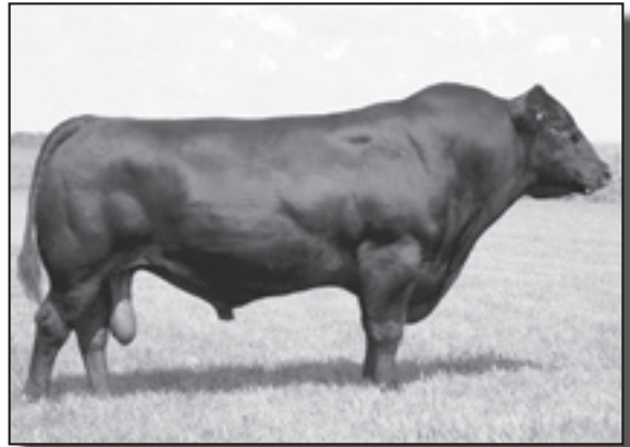
Woodhill Foresight - Sire of Lots 70-75.

• We used Foresight a couple years ago and our customers wanted more. He is a bull that covers a lot of bases. He is high growth with good carcass and makes real productive females. His dam is the popular Bon View Gammer 85 that also produced Bon View New Design 878.