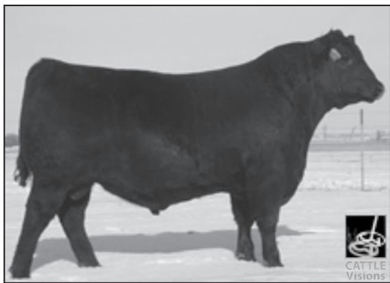
Mohnen Crown Royal 316 - Sire of Lots 51-54.