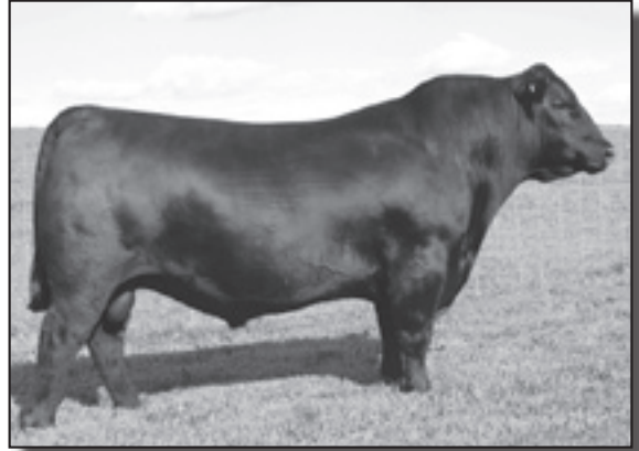
SAV Bismarck 5682 - Sire of Lots 55-58.