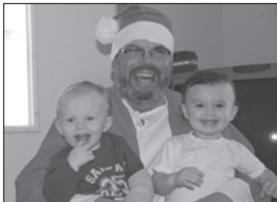
Santa couldn't make it in the blizzard, so he sent his helper!