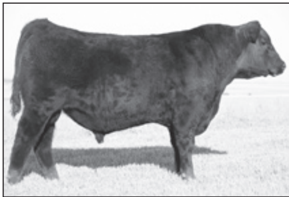
Mohnen Brushpopper 295 349 - Lot 31