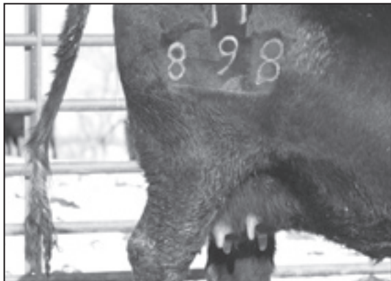
Dynamite first-calf heifer udder.