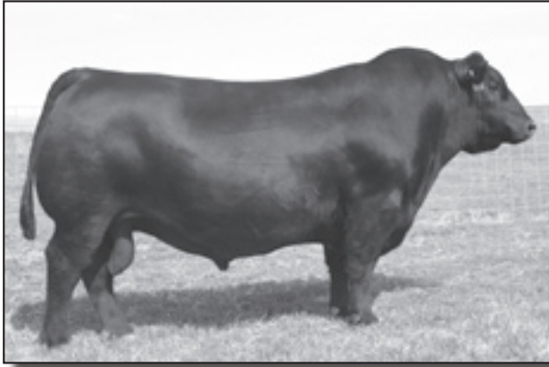
SAV Net Worth - Sire of LT Net Worth, Reference Sire M.