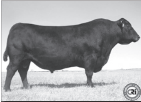
Mohnen Brushpopper 353 - Sire of Lots 13-30.