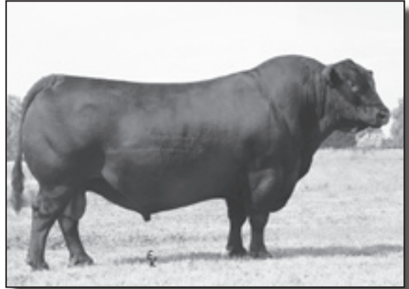
SAV Final Answer 0035 - Sire of Lots 59-60.