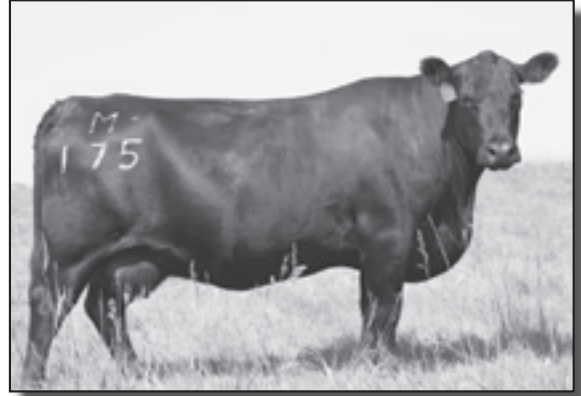
Mohnen Erica 175 - Dam of Lot 6.