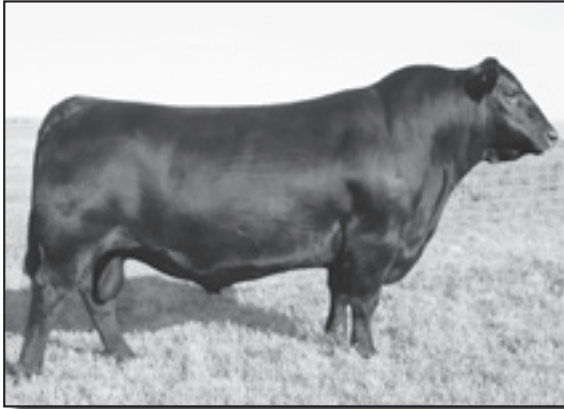
SAV 004 Density 4336 - Sire of Lots 61-66.