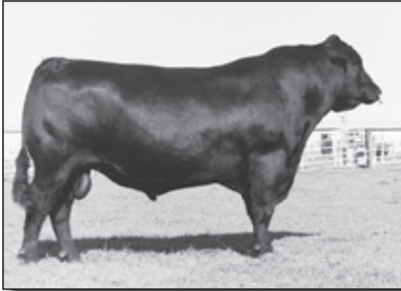
SAF Focus of ER - Sire of Lots 76-78.