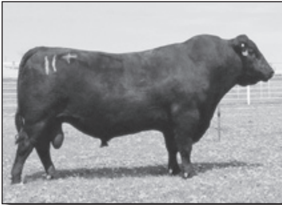
Connealy Freightliner - Sire of Lots 79-84.