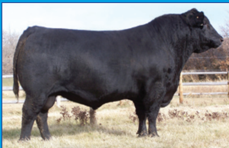
Mohnen Dynamite 1356