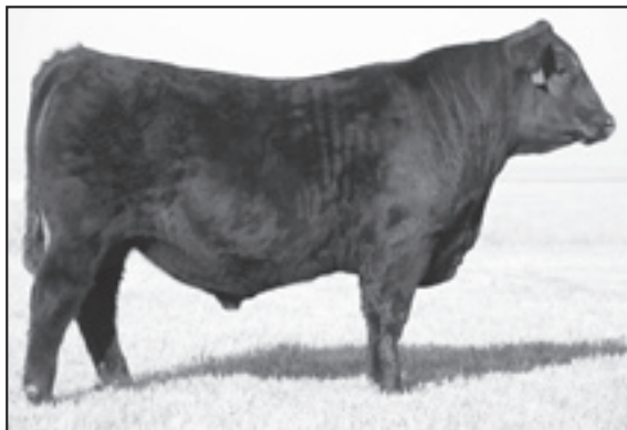
Mohnen Brushpopper 295 1639 - Lot 32