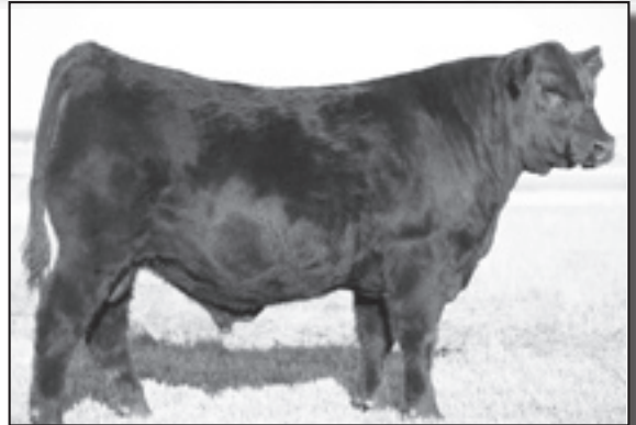
Mohnen Aberdeen 619 - Lot 35