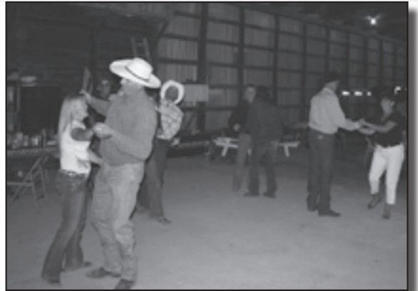
Enjoying the evening at our appreciation supper.