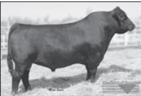
Mohnen Brushpopper 295 - Sire of Lots 31 and 32.